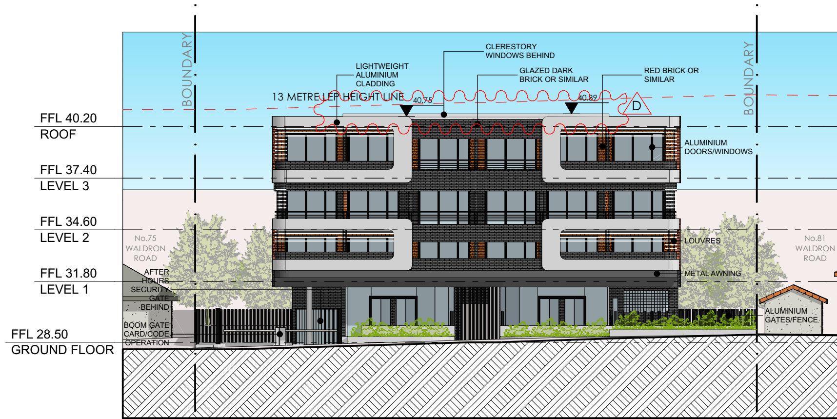
1 NORTH ELEVATION 1:200